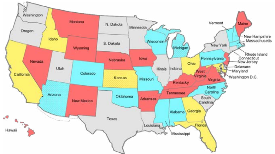
Exhibit 1 Status of States and Territories Considering FirstNet Draft Plans (August 2017)

This whitepaper is designed to help state officials and governors evaluate the available information and outline the benefits of issuing a Request for Proposals (RFP) to ensure that states get the best FirstNet deal meeting their public safety needs. Exhibit 1 shows that as of September 1, a total of 20 of the 56 states and territories have issued a Letter of Intent (LOI) to Opt-in to the FirstNet plan that would allow AT&T to deploy and maintain the LTE radio access network (RAN) within the state's borders.